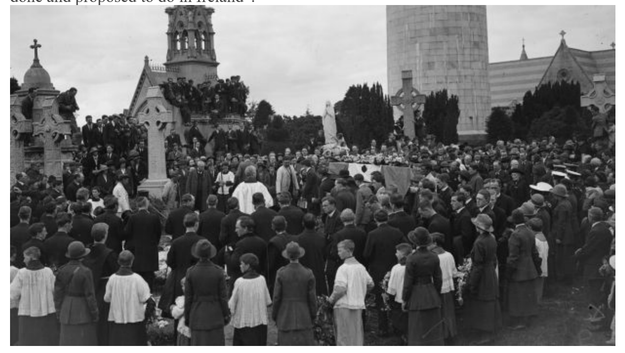
July 1922: The funeral of Cathal Brugha at Glasnevin cemetery in Dublin.