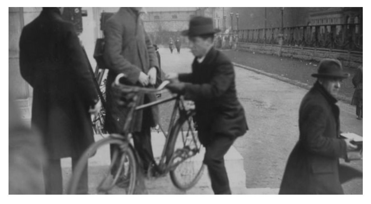
December 1921: Cathal Brugha arrives by bicycle at a Dáil Éireann meeting in Dublin University.