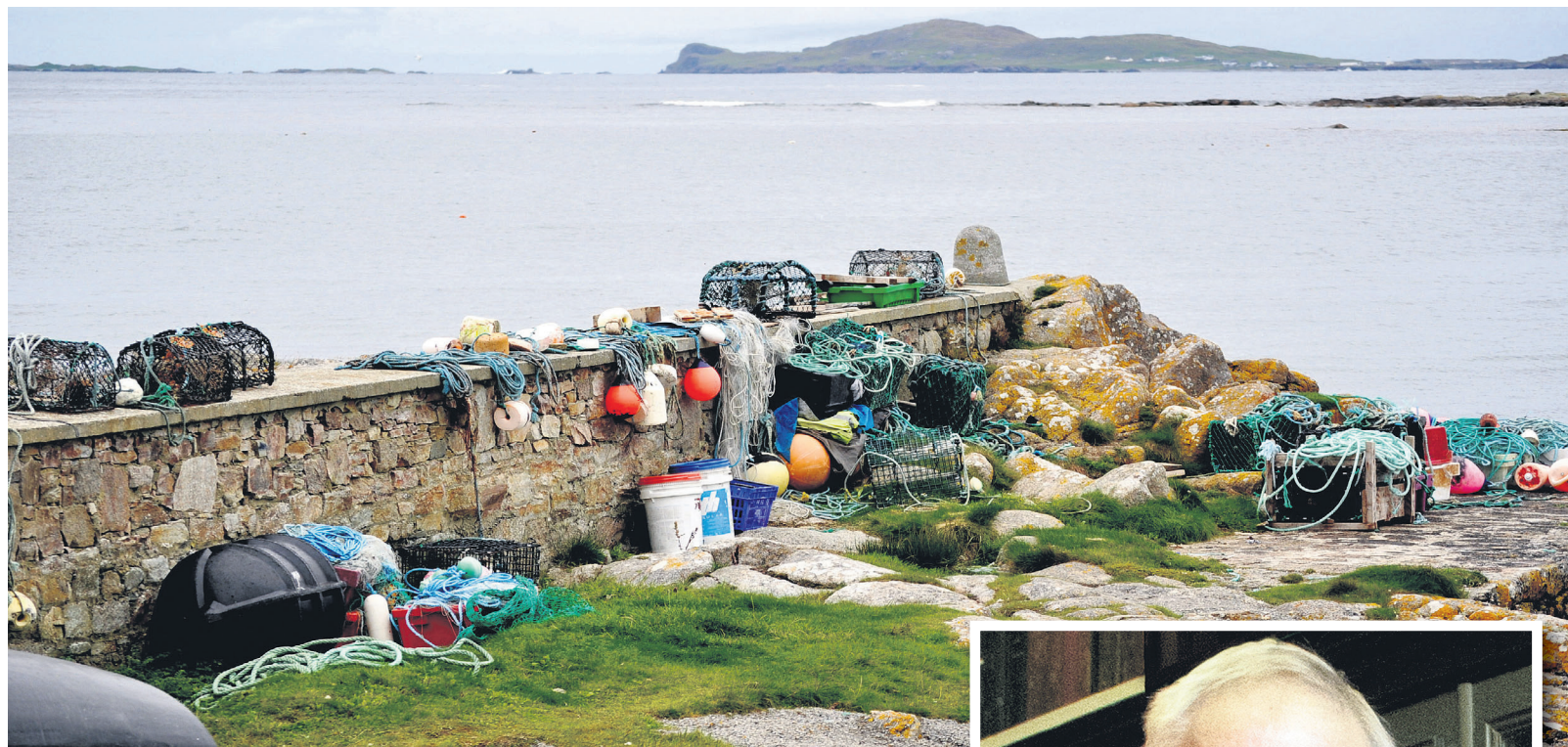
Inishbofin from Rosadillisk near Cleggan. Scenes like these inspired Longley, Heaney and Mahon.

"In Kilronan we hired a jaunty car that took us to our guest house."