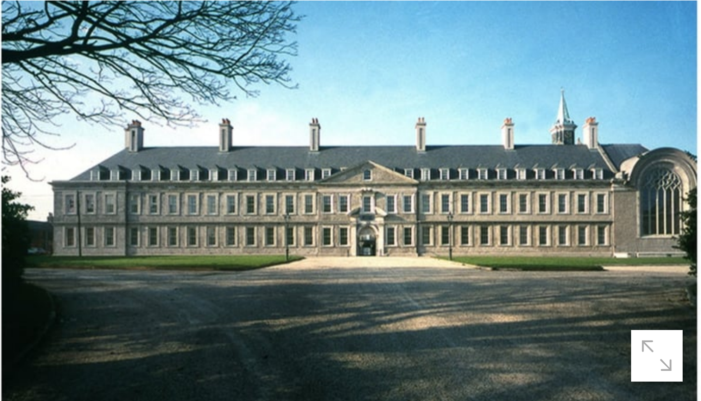
Royal Hospital Kilmainham