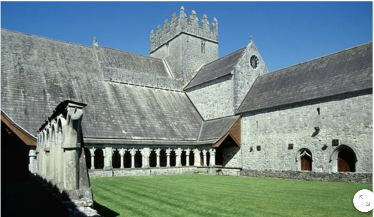
Holycross Abbey

Today the situation is different. New legislation for the protection of the architectural heritage has been enacted, although anomalies remain and the degree of protection under planning laws is still uncertain. 6 Deficiencies in the regulatory environment are being recognised and debated, and are the focus of revision within departments of government. Important buildings of the eighteenth and nineteenth centuries have been conserved by state action, while at local level, historic buildings are routinely recycled for new uses. Deficiencies in knowledge and skill are becoming recognised, and moves are underway to tackle shortcomings through training institutions and industry initiatives.